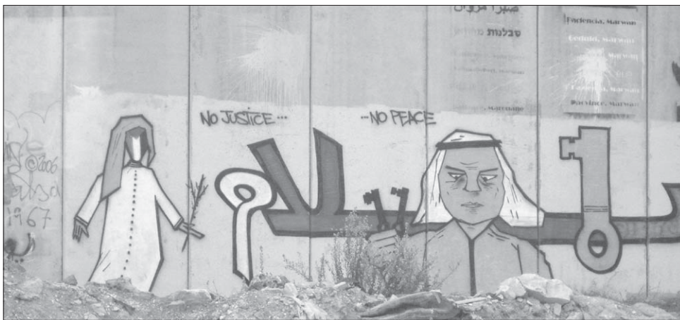
Read about Israel's illegal wall on the Internet. The wall confiscates Palestinian land and restricts Palestinian movement, farming and commerce.